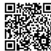
Bb journal instructions

Thinking about the way you learn, called "metacognition," can help you study better and improve your grades! To encourage reflective thinking, I am offering an additional +2 points on the 200-point final exam for everyone who keeps a journal throughout the term, even if you don't join a study group. I will give you weekly prompts to get you started on your journal entries. Students who join an OLC will have an opportunity to earn +4 points total because they will be doing weekly journals.